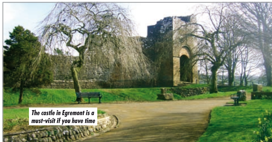
The castle in Egremont is a must-visit if you have time

🍷 Evening meal: Self catering or plenty of pubs/restaurants nearby