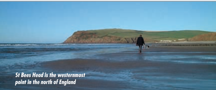
St Bees Head is the westernmost point in the north of England

T hrough popular request we have decided this year to introduce a third possible start to the route: St Bees, the seaside neighbour of the newly vibrant Egremont.