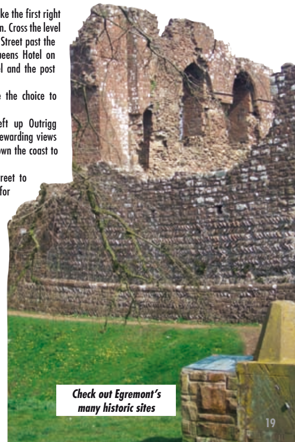
Check out Egremont's many historic sites

About a mile north of Egremont is Clintz Quarry Nature Reserve, a limestone quarry of dramatic proportions, with manmade cliffs 100ft high, which is home to some rare orchids in May and June, as well as a sanctuary for birds.