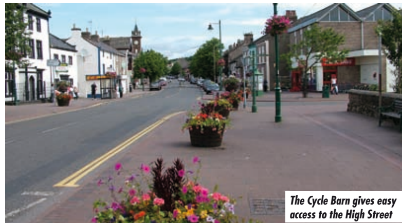
The Cycle Barn gives easy access to the High Street

👁 Under new ownership and awaiting inspection